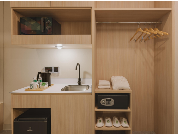
Hotel101 Showroom (Walkway)