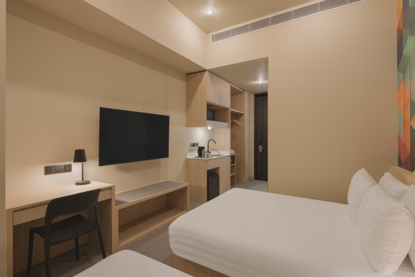
Hotel101 Showroom (Bedroom, v2)