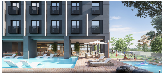
H101-Madrid OutdoorPool v1 02