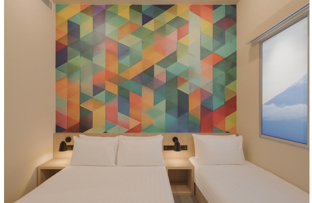
Hotel101 Showroom (Bedroom, v3)