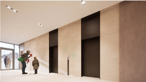
H101-Madrid Lobby v7 02